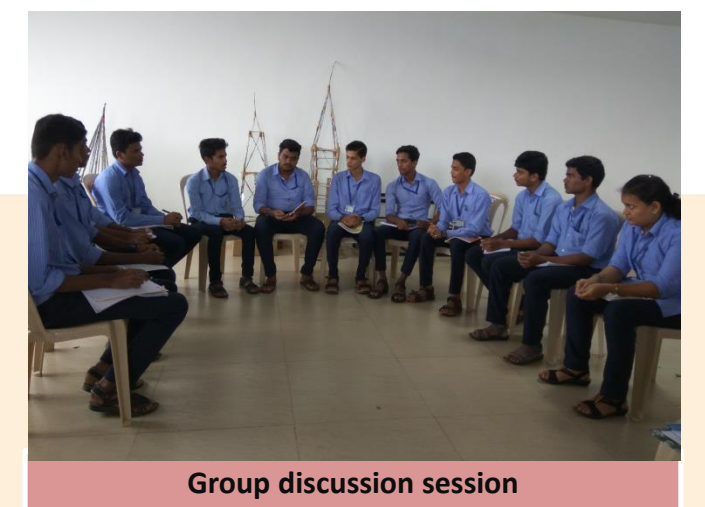
Seminar activity by students