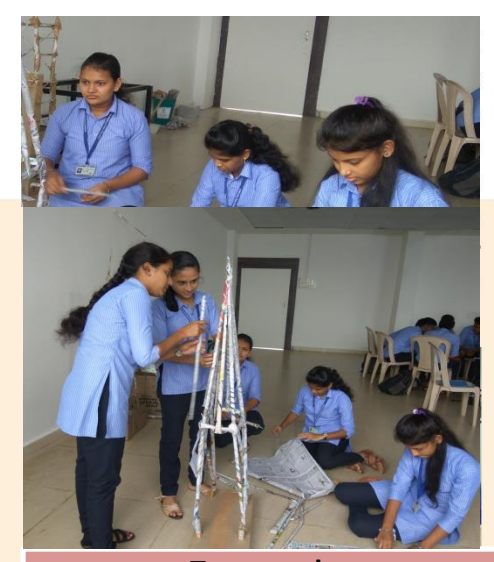
Teamwork Model Making activity

Revolutionary steps for career excellence