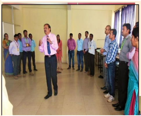
Train the trainer program for staff